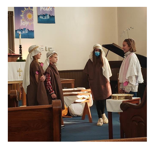
The Angel tells the Shepherds