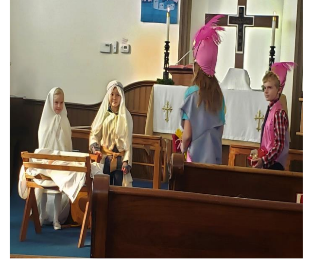
The Wise Men Visit